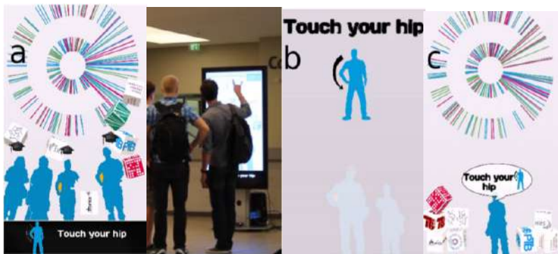
[StrikeAPose: Revealing Mid-Air Gestures on Public Displays, UIST'13]

Interactive displays can be used for movement training e.g for gestures and physiotherapy exercises.